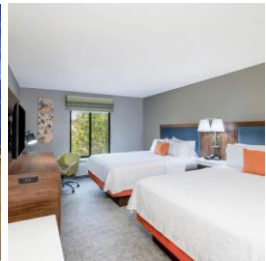
HAMPTON INN & SUITES - OPELIKA