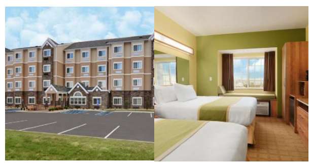
MICROTEL INN & SUITES AT TIGER TOWN

DETAILS: <u>Click to Book</u> PHONE: (334) 745-4311